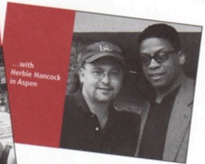
...with Herbie Hancock in Aspen