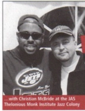
...with Christian McBride at the JAS Thelonious Monk Institute Jazz Colony